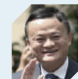
Jack MA Founder, Alibaba Group