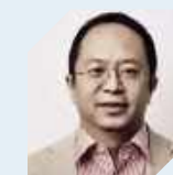
ZHOU Hongyi President, Qihoo 360