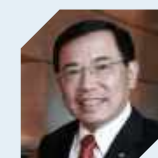
LI Dongsheng Chairman and CEO, TCL