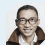
CHEN Yidan Co-Founder, Tencent