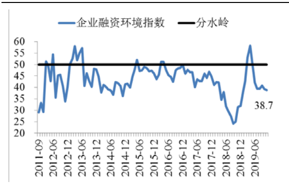
Figure 4 Corporate Financing Index